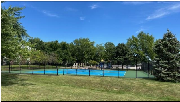
Mallard Ridge Park Pickleball/Tennis Courts