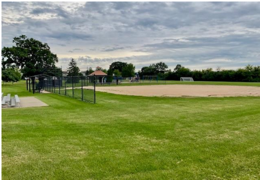
Heritage Trails Park Coles Baseball Field