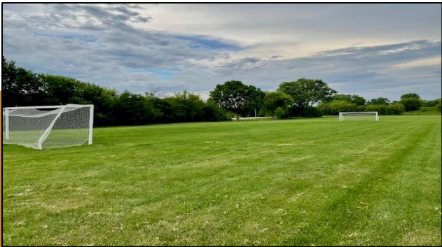
Heritage Trails Park Soccer Field

For more information on our rental opportunities, contact Lori Friedl at 847.356.6011 or lfriedl@lindenhurstparks.org , or stop by the Community Center at 2200 East Grass Lake Road.